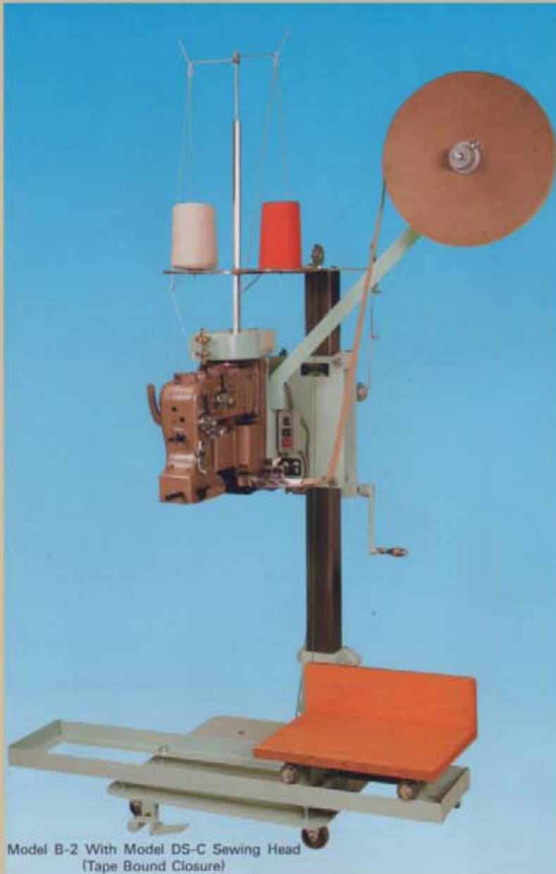
Model B-2 With Model DS-C Sewing Head (Tape Bound Closure)

from the left end. As the bag is sewn, the table moves lightly on the inclined rail, so you just support it and need not push it. The inclination of the rail can be adjusted according to the weight of the bag and the thread is automatically cut.